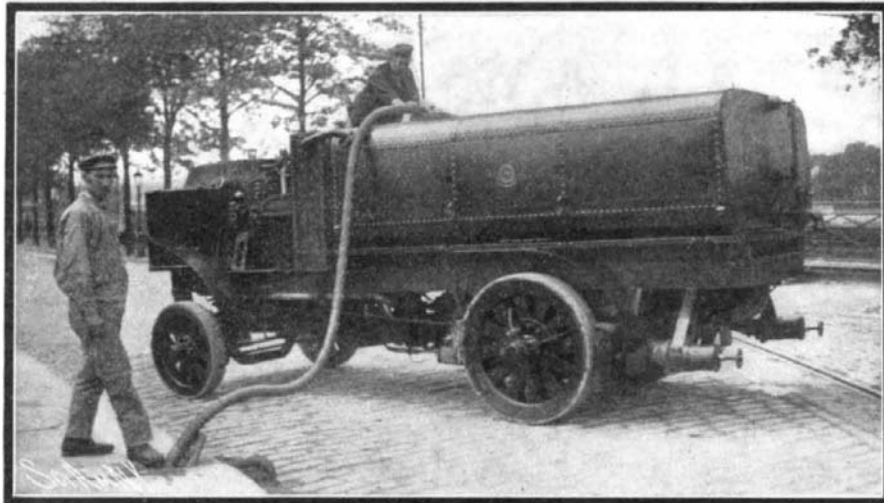
FILLING UP THE TANK OF THE AUTOMOBILE STREET SPRINKLER.

square yards, and this can be covered in a quarter of an hour.