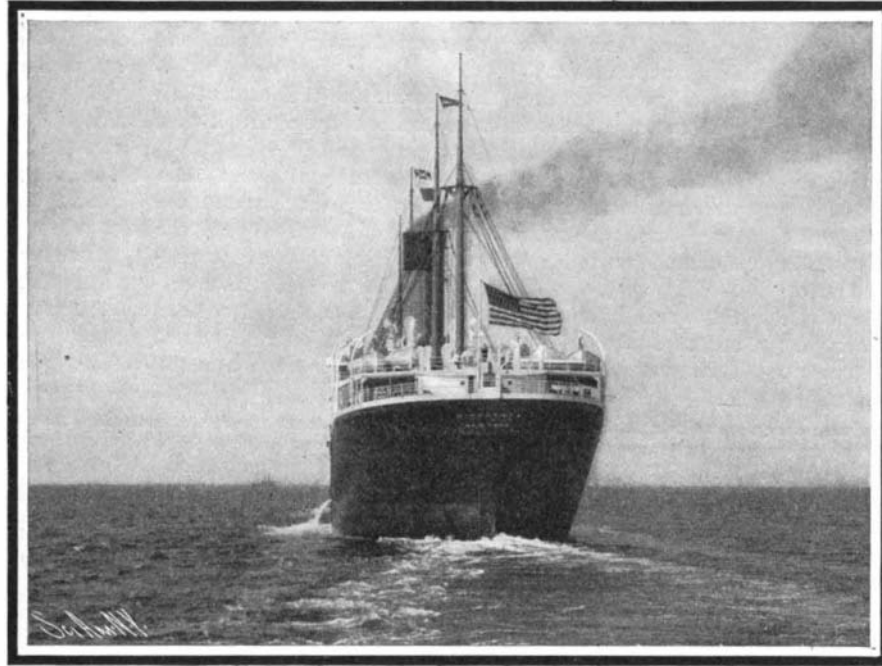
View from Astern, Showing the Great Beam.

and the boat deck, the boat deck being 25½ feet above the promenade deck or 81½ feet above the keel; while another 8 feet above this, or 90 feet above the keel, is the navigating bridge. Now, since the vessel at her full draft will draw 33 feet, it follows that the navigating bridge will at that draft be 57 feet above the water-line. In the light condition in which she entered New York harbor, she drew something less than 20 feet, consequently the navigating bridge was about