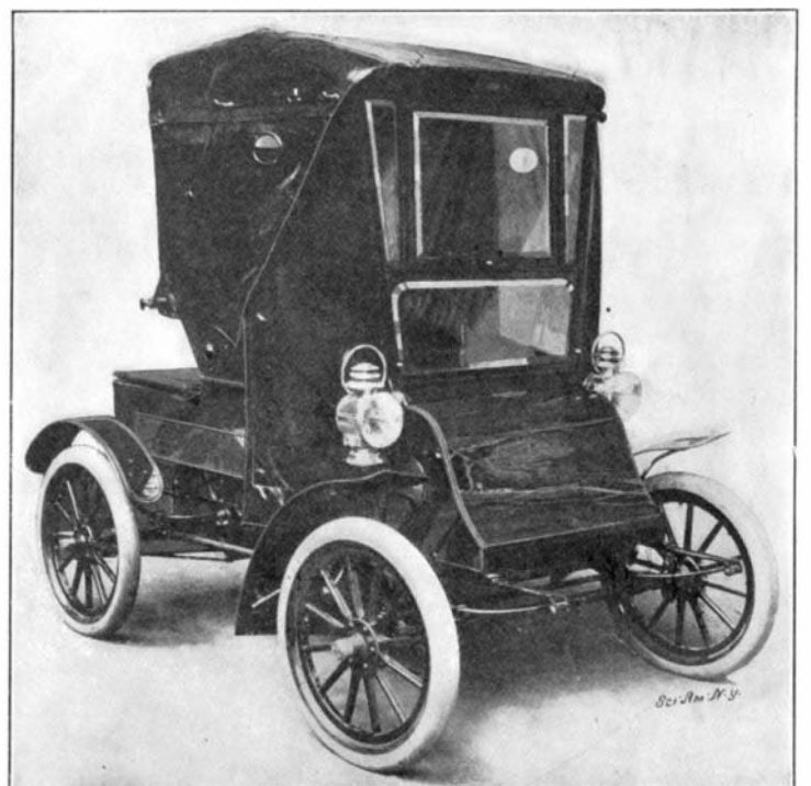
GLASS FRONT AND SIDE CURTAINS AS APPLIED TO A RUNABOUT.

A brake shoe is being constructed by an American firm having a hard iron insert around which is cast the body of the shoe in gray iron. The gray iron is not permitted to chill, which is claimed to be a peculiarity of this shoe as compared to others of the kind. The hard iron is made of very high-grade malleable iron. The secret processes of casting gray iron about the insert without chilling are said to give toughness to the body of the shoe, and a better friction coefficient than a chilled shoe.