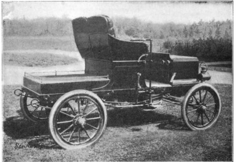
THE GROUT STEAM RUNABOUT.

The machine is capable of a speed of 15 or 20 miles an hour over ordinary roads, and of climbing 25 to 35 per cent grades. The platform behind makes it useful for touring or for other purposes where the carrying of luggage is required. The Grout Brothers also make a novel touring car with wheel steer and wheel throttle.