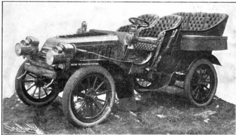
THE MITCHELL AIR-COOLED FOUR-CYLINDER TONNEAU.

The air-cooled motor on the Regas cars is of distinctly novel design, as will be seen from the illustration. It is a two-cylinder motor with the cylinders set at an angle of about 45 degrees, an arrangement which is said to greatly reduce vibration and, in this instance, to allow of a better air circulation around the cylinders. The method of cooling the cylinder is new. It consists of clamping against it, by means of an