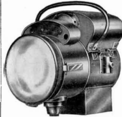
Phare Solar. Price, $25 each.