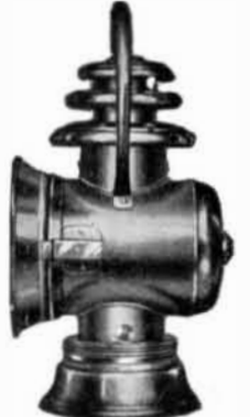
Junior Oil Side Lamp. Price, $11.

They are made to give absolutely satisfactory service under most adverse conditions.