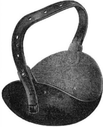
Elastic Pad for Penmen. FIG. 1.

The annexed engravings are views of an Elastic Pad to be placed on the arm for giving ease to penmen when writing. A patent was granted for the improvement on the 29th of April, 1851, to Joseph G. Goshon, of Shirleysburg, Pa., and William H. Towers, of Bucyrus, Ohio. Figure 1 is a perspective view of the pad, and figure 2 is a view of it applied to the arm of a penman. The pad is made of an elastic material, such as india rubber or an air cushion, it is of a semi-globe form, the inside, A, being concave, and the outside, B, convex; C is a small band or strip of leather, or any other suitable substance; it is permanently secured to one side of the pad, and has a number of small button holes in it. A small button is secured on a lug, E, on the other side of the pad, and the strap is represented as buttoned at D. This strap allows of a pad being adapted for arms of various thickness, also for securing it on any part of the arm, from the elbow to the wrist, as the wearer may require.