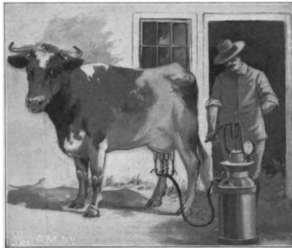
A COW-MILKING MACHINE.

COW-MILKER. —There remain in these days of invention but few hand operations which cannot be