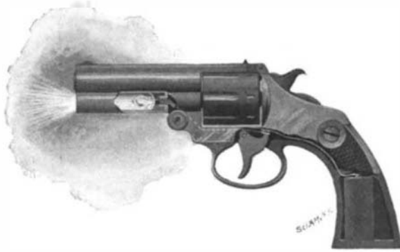
COMBINATION REVOLVER AND DARK LANTERN.

COMBINATION REVOLVER AND DARK LANTERN. —The revolver shown in our illustration would be of inestimable value in case of an emergency at night. Its distinguishing feature lies in the small incandescent lamp situated in a reflector tube placed immediately below the revolver barrel. A battery in the