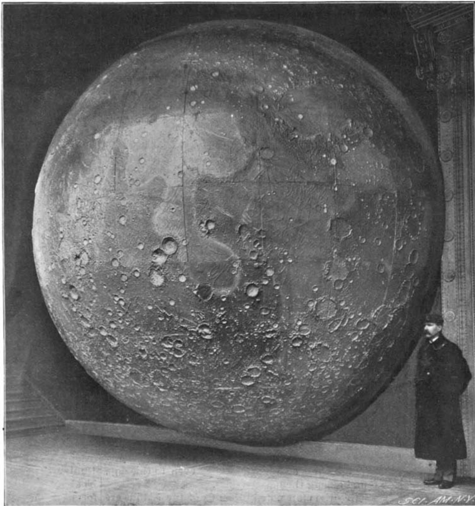
MODEL OF THE MOON NINETEEN FEET IN DIAMETER RECENTLY INSTALLED IN THE FIELD COLUMBIAN MUSEUM.

The method simply consisted in: 1. The use of vessels with well-fitting, overlapping lids, instead of the inside lids used in kitchens the world over, which allow stray bits of matter that may adhere to their rim to fall into the food. 2. Avoidance of opening the vessels in which the food was kept, or, where this was indispensable, careful manipulation as in bacteriological work. 3. The use of cotton wool as a covering. Cotton-wool lids had been specially prepared to fit the wide tops of the food vessels; they consisted of a circular disk of cotton wool, tightly held between two metal rings, the outer of which formed the overlapping rim of the lid. The Gazette says that it is to be hoped that Dr. Jäger will find imitators, and that "kitchen bacteriology" may become a study with ladies. Certainly there is much room for improvement in the old-fashioned kitchen methods to which our "family plain cooks" cling with such desperate energy, and which they seem to regard with an almost superstitious reverence.