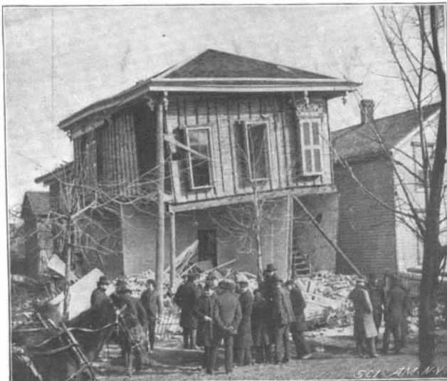
FRONT OF HOUSE WRECKED BY GAS EXPLOSION.

It will be remembered that Queen Victoria spoke a message of friendship and good will to the Emperor Menelek, of Abyssinia, after the recent victory in the Soudan. The message created a marked impression on his Majesty. The royal words were delivered on a Sunday, the phonograph working excellent-