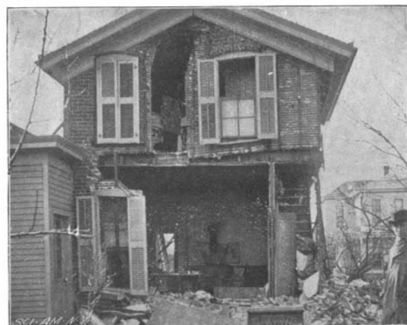
REAR OF HOUSE WRECKED BY GAS EXPLOSION.

ly. The tones of her Majesty's voice were reproduced with remarkable clearness, and Menelek was so pleased that nothing would satisfy him but to hear the message at least a dozen times. First he would listen to the words as they came from the trumpet of the phonograph, and then he would use the ear tubes. When his curiosity and delight had been satisfied, he relapsed into solemn silence, and ordered the royal salute and remained standing while seventeen guns were fired. Menelek himself has tried to send a message by the phonograph, so that he appreciates the difficulty of securing a satisfactory record.