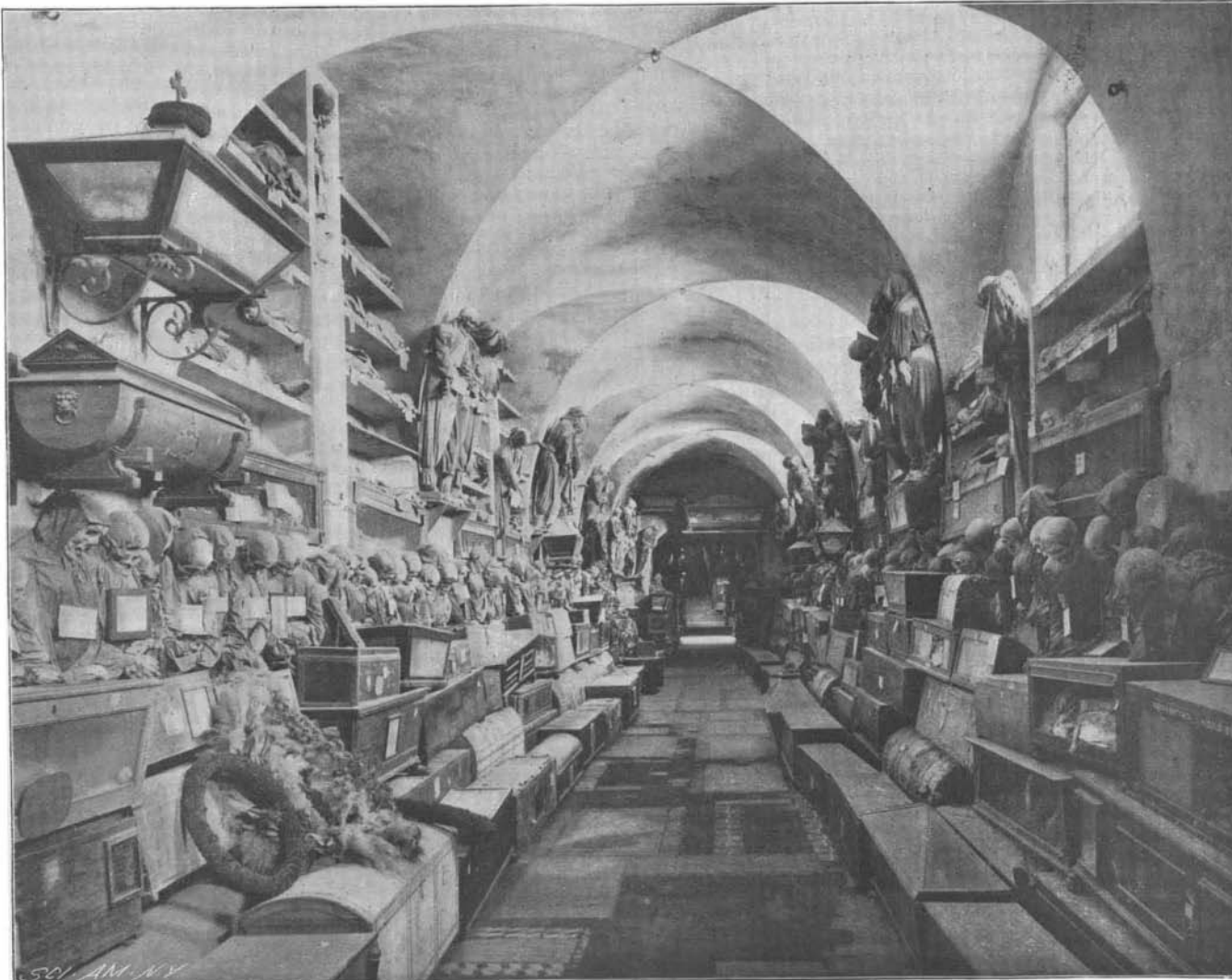
THE CATACOMBS OF THE CAPPUCCINI, PALERMO, SICILY.

PASSENGER fare on the new Congo railroad is 33¼ cents per mile.