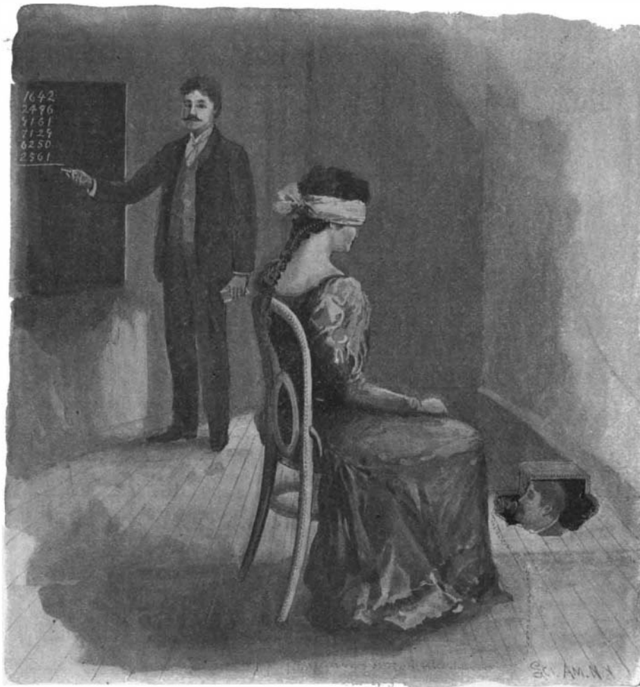
THE SPEAKING TUBE.

stage in plain view of the audience. Her eyes are heavily bandaged, so she cannot see. A committee is invited to go upon the stage to see that the lady has had her eyes properly blindfolded and also ostensibly to help the operator. A large black board is placed at one side of the stage behind the lady. One of the committee is requested to step to this blackboard and write on it with chalk some figures, usually up to four or more decimal places, and after he has done so he resumes his seat. The lady immediately appears to add up the number mentally, calling out the numbers and giving the results of the addition.