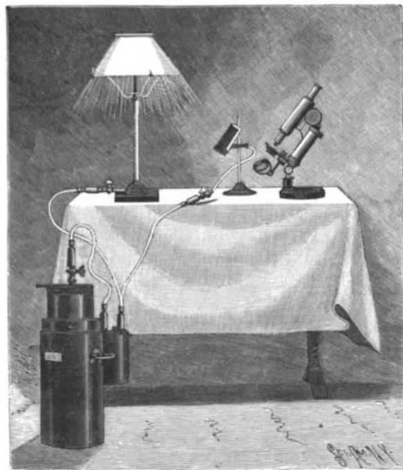
THE FULLER ACETYLENE GENERATOR IN USE FOR READING AND MICROSCOPY.

face condenser cooled by water, the purpose of which condenser is to remove water from the gas in order that it shall be dry. Moreover, the gas, as will be seen, is collected from the very top of the bell. In rising to this point it comes to a certain extent in contact with the upper layers of the carbide, which in their turn act as a very efficient drier. Thus the gas is delivered in the best possible condition to the burners.