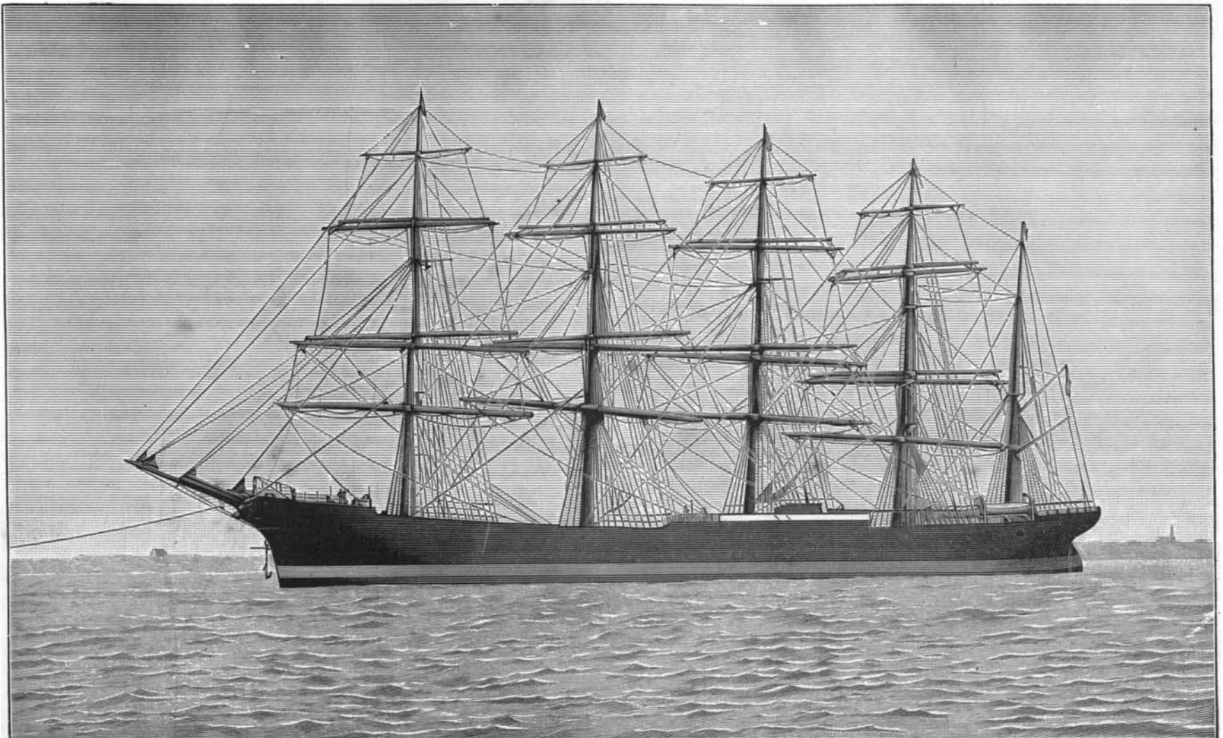
THE LARGEST SAILING VESSEL IN THE WORLD.

Practically all the wood used in making spools for thread in this country and Great Britain is cut in Maine forests, but so great is the amount of lumber required each year for the making of these seemingly insignificant articles that Maine will not be able to supply the raw material much longer. The spools are made of birch wood, and the birch of the Maine forests is the best for the purpose. More than two million feet of lumber is shipped to Scotland every year for the use of the great thread manufactories there, and almost as much is supplied to domestic manufacturers. The business began in Maine twenty-five years ago, and land that was cut over at that time is now well covered with young trees, but not for twenty-five years more will this timber be fit to cut.