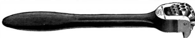
THE STANDARD EMERY WHEEL DRESSER.

Visiting, in 1886, the several works at and near St. Etienne, where the chrome steel projectiles were being produced, their successful manufacture being then of comparatively recent date, I saw, at more than one establishment, a large number of projectiles which had sustained spontaneous fracture. In one store where the finished shot were stacked, after the lapse of the period during which the tendency to the development of cracks or to rupture was stated to diminish gradually, I saw the head of one out of a pile of projectiles which had quite recently been projected to a distance of many feet by the violent spontaneous rupture of the metal. Instances of the development of flaws in these projectiles are now, so far as our experience at Woolwich goes, exceedingly rare, and the remarkable power possessed by these formidable punching tools of pene-