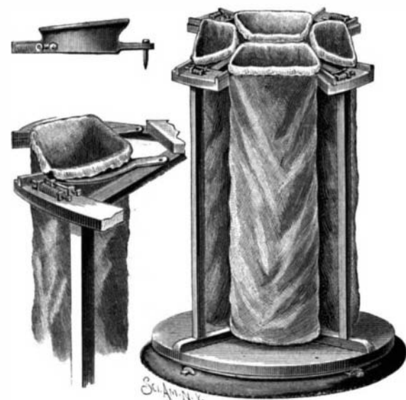
DAVNIIE'S BAG HOLDER.

most position, or away from the fixed arm, by means of the tension of the spring. The other rod has a collar abutting against a bearing, to limit the movement of the swinging arm. In placing bags in position on the holder, the operator first passes the upper edges of the bag over the flange of the fixed arm, then moves toward it the swinging arm, and passes the other edges of the bag over the latter, the coiled spring then drawing the movable arm backward, holding open the mouth of the bag, and supporting it in position between the two arms. The frame is then revolved for the placing of other bags in position in a similar manner.