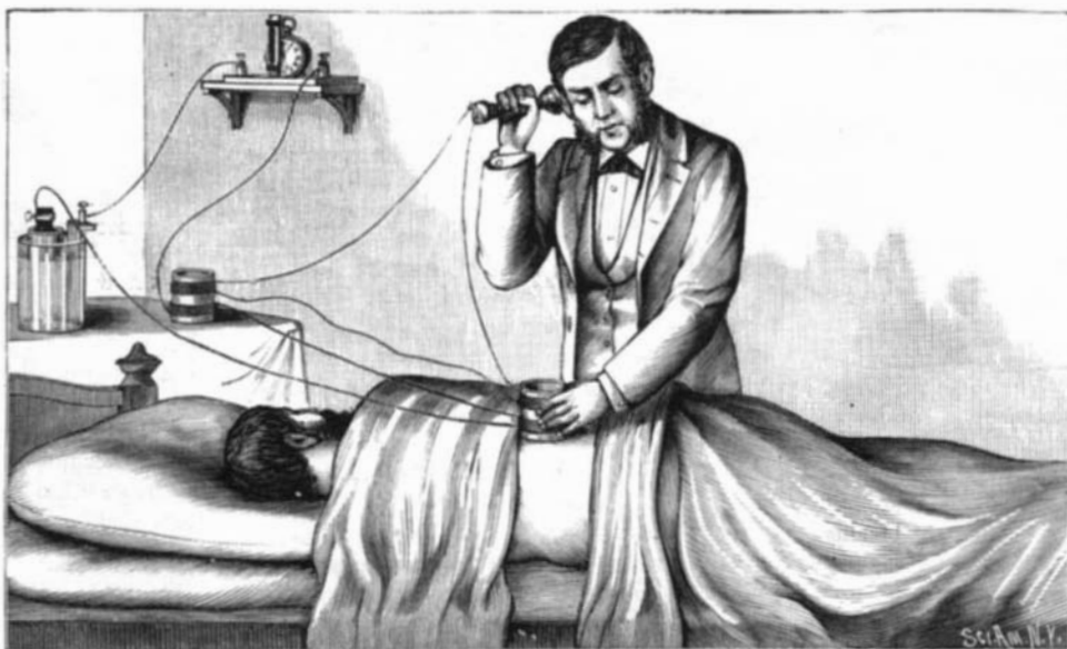
Fig. 1.—THE INDUCTION BALANCE USED AS A BULLET FINDER.