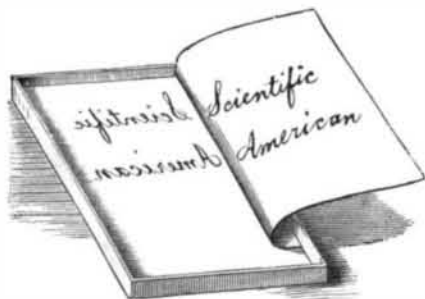
STENCIL COPYING TABLET.

When the print becomes faint the stencil may be folded over and pressed against the tablet as before, the adhesion of the edge of this stencil securing, with a little care, proper registration and the rubbing re-enforcing the transfer. A few minutes is all that is required for this re-enforcing.