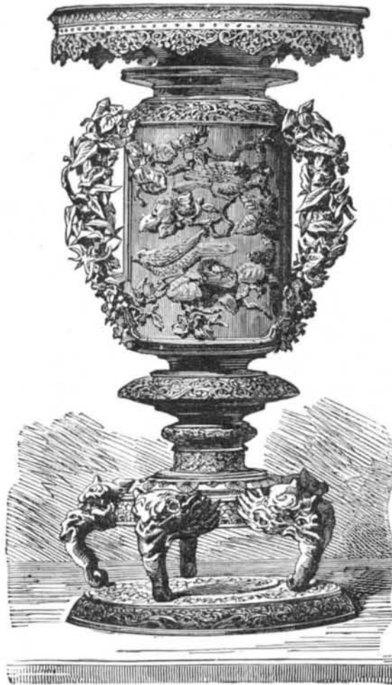
JAPANESE BRONZE VASE.

The engraving on this page will be recognized by every one as an example of Japanese art. This vase stands about four feet in height. It is of bronze, a favorite material with the Japanese metal workers, who are certainly unsurpassed by any people in the world for originality of design and skill in execution. This is an excellent specimen of their peculiar method. In the grotesques at the base and in the relief ornamentation on the sides we see that peculiar exaggeration and distortion of natural objects which many people prefer to the conventionalism obtaining with Euro-