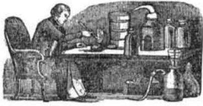
For the Scientific American. New Chemical Law. No. 9.

According to the conditions of this law, all of the compounds of an aggregated series, should also possess similar chemical properties. The following examples serve to show the close similarity of the compounds of the aggregated series just given, and also the gradual increase and decrease of properties as the series increase. We will commence by introducing their oxacids.