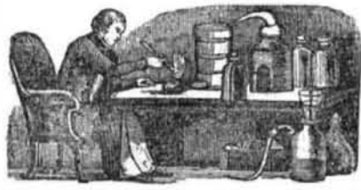
For the Scientific American. New Chemical Law.