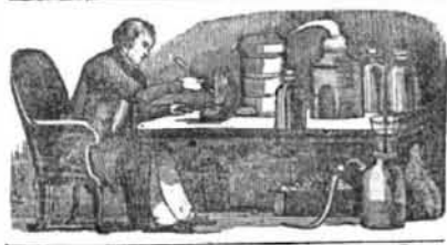
For the Scientific American. New Chemical Law. No. 8.