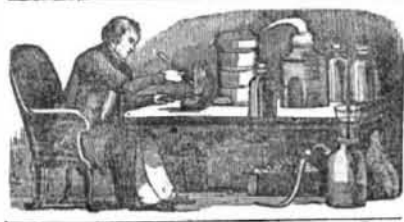
For the Scientific American. New Chemical Law.