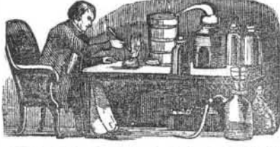
Emission of Light from various Solid and Fluid Substances, and Animal Matter.

The emission of light from the glow-worm is a fact with which every one is acquainted. A similar effect is known to be produced by several animal substances in a state of decomposition: and from decayed wood is experienced a like luminous appearance. Persons who have witnessed the beautiful phosphorescent effects of the sea, in a dark night, must likewise have been forcibly struck with the radiations of so singular a phenomenon. Such peculiarities in nature cannot be supposed to have escaped the notice of the prying philosopher. Newton, and other eminent philosophers conceived the sun to be a vast body of fire: but the more improved instruments of Bode, Herschel, Schroeter, and other modern astronomers, have contributed to determine that the solar mass is opaque; and these opinions are strongly confirmed by the results of a long course of experiments made by Arago on the emission of light from bodies actually opaque, and which promise to solve many difficulties as to the physical constitution of the sun.