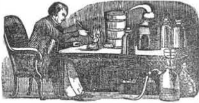
Emission of Light from various Solid and Fluid Substances, and Animal Matter.

The emission of light from the glow-worm is a fact with which every one is acquainted. A similar effect is known to be produced by several animal substances in a state of decomposition: and from decayed wood is experienced a like luminous appearance. Persons who have witnessed the beautiful phosphorescent effects of the sea, in a dark night, must likewise have been forcibly struck with the radiations of so singular a phenomenon. Such peculiarities in nature cannot be supposed to have escaped the notice of the prying philosopher. Newton, and other eminent philosophers conceived the sun to be a vast body of fire: but the more improved instruments of Bode, Herschel, Schroeter, and other modern astronomers, have contributed to determine that the solar mass is opaque; and these opinions are strongly confirmed by the results of a long course of experiments made by Arago on the emission of light from bodies actually opaque, and which promise to solve many difficulties as to the physical constitution of the sun.