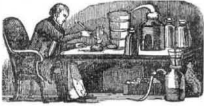
For the Scientific American. New Chemical Law.