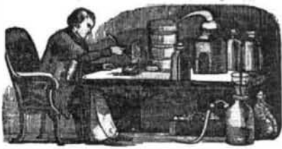
For the Scientific American. Patent Laws and Business.

We have already pointed out three reforms which in our opinion should be made in the Patent Laws. These reforms are,