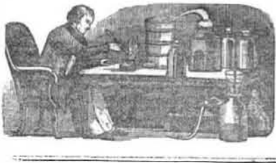
For the Scientific American. Patent Laws and Business.

After what we have said in previous articles respecting the action of the Patent Office, we would now state one unanswerable argument as a friendly hint to the Patent Office to be liberal in decisions. An Examiner may be too apt to assume the office of a Judge, forgetting that at best, a Patent is but a mere opinion of the Patent Office, in respect to originality and usefulness. The Patent Laws were framed by a lawyer and he took good care to engraft upon them the old English proviso of business for the trade. The 12th section of the law of 1836, says, "Provided, however, That no opinion or decision of any Board of Examiners, under the provisions of this act, shall preclude any person interested in favor or against the validity of any patent, which has been or may hereafter be granted, from the right to contest the same in any judicial court, in any action in which the validity may come in question." Thus the law is plain that a patent is but an opinion of the Patent Office, subject to be reversed or confirmed by action at law.