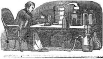
For the Scientific American. Patent Laws and Business.

I have endeavored to show conclusively that the object of the Law of Patents was to cover a very extensive field for the encouragement of the Arts in the Republic. I have also thrown out some very broad hints against the narrow mindedness of some Patent Office decisions. There is certainly a great reform wanted both in the management of the Office and in our U. S. District Courts too. In the latter place—it is correct information, in the former, a right spirit.