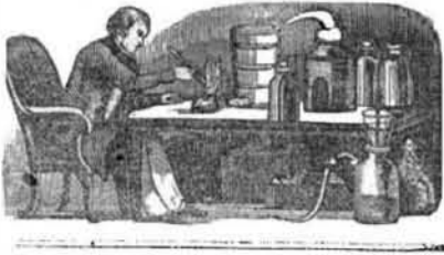
For the Scientific American. Patent Laws and Business.

I have endeavored to show conclusively that the object of the Law of Patents was to cover a very extensive field for the encouragement of the Arts in the Republic. I have also thrown out some very broad hints against the narrow mindedness of some Patent Office decisions. There is certainly a great reform wanted both in the management of the Office and in our U. S. District Courts too. In the latter place—it is correct information, in the former, a right spirit.