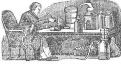
For the Scientific American. New Chemical Law. No. 4.

All the conditions required by this law cannot at present be given, because there are many substances with which we are but little acquainted. The result of future experiments must, however, coincide with the requirements of the law.