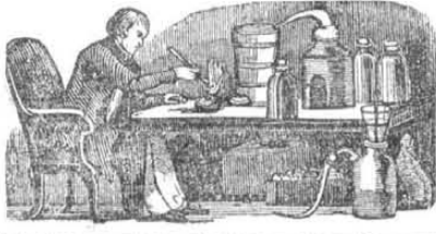
For the Scientific American.