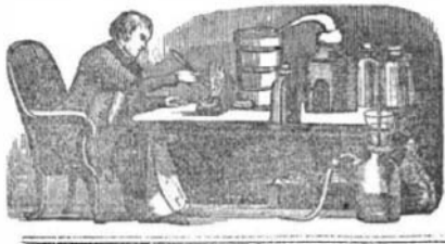
For the Scientific American.