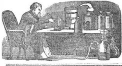
For the Scientific American.