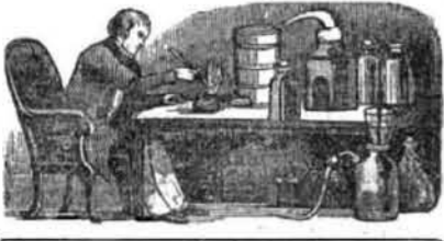
For the Scientific American.