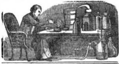
New System of Oil-Painting.