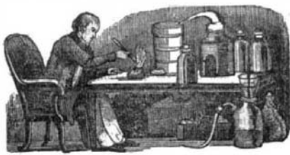
For the Scientific American.

This metal in its metallic form is not possessed of noxious properties, but its compounds are nearly as dangerous as arsenic. Corrosive sublimate is the most dangerous salt of mercury—it is something like arsenious acid in its effects—three grains of it having been known to destroy the life of an adult. Corrosive sublimate is generally found in the form of a heavy white powder, or in heavy crystalline cakes. Its taste is metallic and acrid, and can easily be detected in the mouth—being very different from arsenic in this respect. It is very soluble in water—and it faintly redens litmus paper.