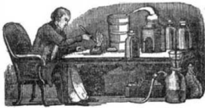
For the Scientific American.