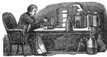
For the Scientific American.