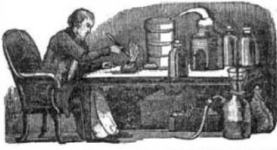
For the Scientific American.