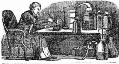
For the Scientific American. New Chemical Law. No. 2.

The following are the outlines of this chemical law given in as brief a manner as possible.