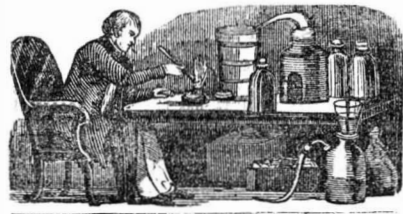
For the Scientific American. New Chemical Law. No. 2.

The following are the outlines of this chemical law given in as brief a manner as possible.