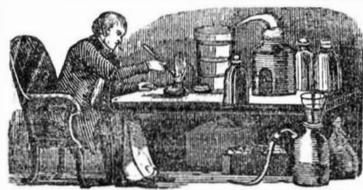
For the Scientific American. New Chemical Law. No. 2.

The following are the outlines of this chemical law given in as brief a manner as possible.