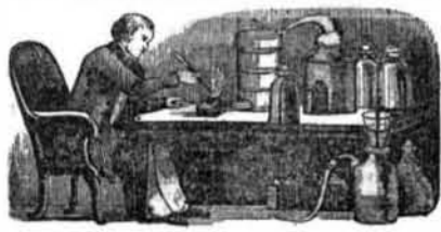
For the Scientific American.