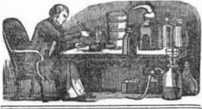
For the Scientific American. New Chemical Law. No. 14.

It has been remarked that oxygen gas in uniting with other substances, bears a strong resemblance to chlorine, bromine and iodine, and like them, possesses strong electro-negative qualities, but it cannot belong to the same aggregated series with these substances, since the chemical properties of its compounds are different. Thus oxygen in uniting with hydrogen, should form a gaseous hydracid similar to the hydrochloric, hydrobromic &c. acids, did it belong to the same aggregated series: but we find instead of producing a gaseous hydracid, water is the result, which being a liquid is contrary to the requirements of the law, and therefore removes all possibility of its belonging to the above mentioned class.— But if it cannot be considered as belonging to the above mentioned class; its manner of union seems to indicate that it may be a compound of that series. By comparing the chemical properties of oxygen with the chemical properties of the compound of chlorine, bromine and iodine, we may discover a compound of known composition, from which by analogy we may be enabled to arrive at the true composition of oxygen. To what compounds then of chlorine, bromine and iodine is it similar?