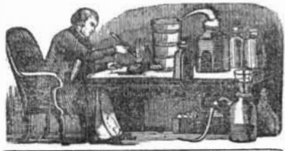
For the Scientific American. New Chemical Law. No. 14.

It has been remarked that oxygen gas in uniting with other substances, bears a strong resemblance to chlorine, bromine and iodine, and like them, possesses strong electro-negative qualities, but it cannot belong to the same aggregated series with these substances, since the chemical properties of its compounds are different. Thus oxygen in uniting with hydrogen, should form a gaseous hydracid similar to the hydrochloric, hydrobromic &c. acids, did it belong to the same aggregated series: but we find instead of producing a gaseous hydracid, water is the result, which being a liquid is contrary to the requirements of the law, and therefore removes all possibility of its belonging to the above mentioned class.— But if it cannot be considered as belonging to the above mentioned class; its manner of union seems to indicate that it may be a compound of that series. By comparing the chemical properties of oxygen with the chemical properties of the compound of chlorine, bromine and iodine, we may discover a compound of known composition, from which by analogy we may be enabled to arrive at the true composition of oxygen. To what compounds then of chlorine, bromine and iodine is it similar?