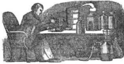
For the Scientific American. New Chemical Law. No. 13.

Proceeding in the classification by the similarity of the chemical properties of substances, we may probably arrive at the following aggregated series derived from the aggregation of a radical whose atomic weight is 6.85.