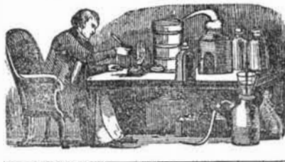
For the Scientific American. New Chemical Law. No. 11.

If we proceed with another class of substances, differing in chemical properties to the four elements we have just classified, we may probably arrive at the following aggregated series, which possess a radical with the atomic weight of 8.