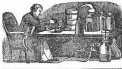
For the Scientific American. New Chemical Law. No. 11.

If we proceed with another class of substances, differing in chemical properties to the four elements we have just classified, we may probably arrive at the following aggregated series, which possess a radical with the atomic weight of 8.