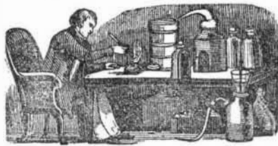
For the Scientific American. New Chemical Law. No. 11.

If we proceed with another class of substances, differing in chemical properties to the four elements we have just classified, we may probably arrive at the following aggregated series, which possess a radical with the atomic weight of 8.