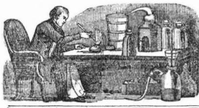
For the Scientific American. New Chemical Law. No 1.

In surveying the present state of chemical science, now so rapidly advancing, it cannot but be perceived, that there is a great deal of confusion and misunderstanding in relation to the composition and classification of chemical substances, and more particularly in the department of Organic Chemistry, about which but comparatively little is known. It is true that chemical analysis gives us the empirical composition of these substances; but what new idea does this teach? We know that the composition of almost all organic substances, consist of the three elements, Carbon, Hydrogen, and Oxygen, united in different proportions, but this is not sufficient, something more is wanted; we want to know the true arrangement of the atoms which compose these substances? and until this is accomplished, but little advancement will be made, in this department of Chemistry.